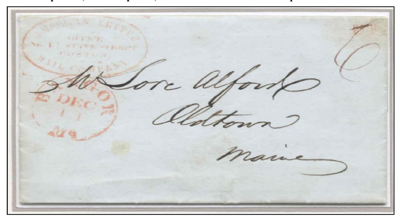
Figure 1. Boston via Bangor to Old Town, Maine December 6, 1844

The cover in Figure 1. is an example of the American Letter Mail Company enlisting the services of a rather unusual partner; their competitor, the United States Post Office Department!